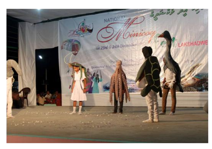
Students of the Navodya Vidyalaya performing "Save us to Save you" at the Minicoy Fest

LMMAs in Lakshadweep. To get the point across he wrote and composed a skit called "Save us to Save you" which was enacted by students of the Navodya Vidyalaya at the Minicoy Fest held at Minicoy, 23–24 December 2012. They also put up a stall called "Protect or Perish" to promote awareness of the fragility of the Islands, mangroves and coral reefs. The festival was attended by over 10,000 people.