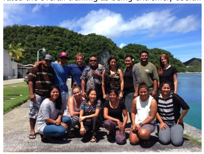
Trainers and participants of Socioeconomic Data Analysis Training Workshop

rated the overall training as being extremely useful.