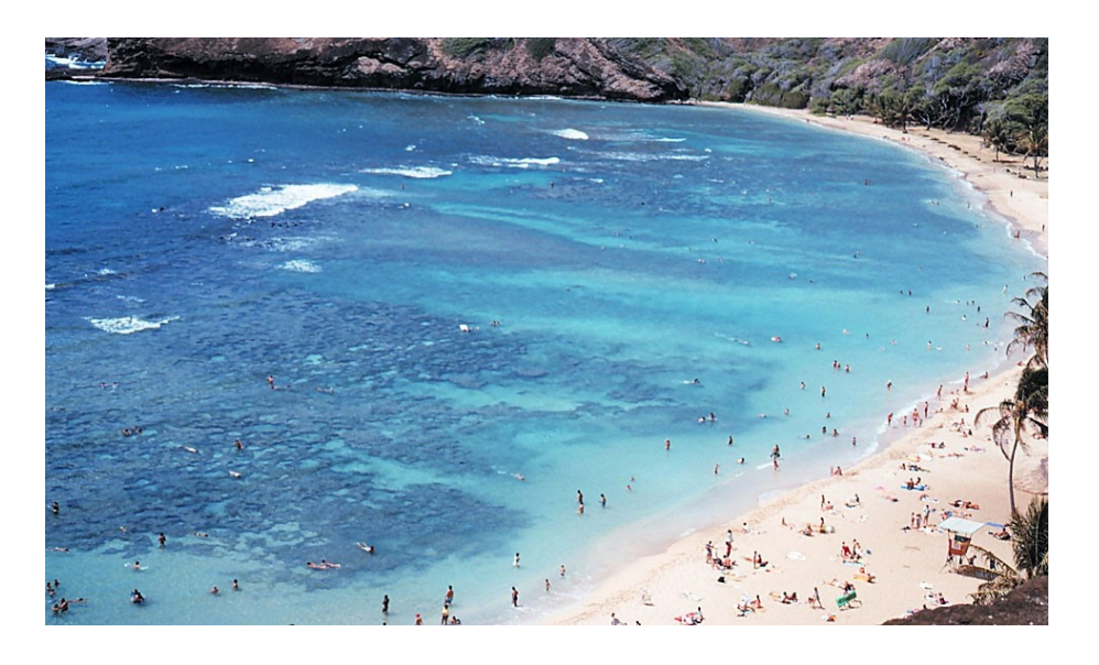
Human Connections to Coastal Ecosystems

Happy International Year of the Reef! #IYOR2018